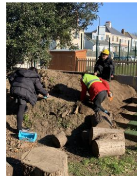
Enjoying role-play and large loose parts play