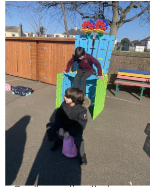
Pupils creating their own constructions and enjoying wheeled toys

If they, or you, have any suggestions for further activities/opportunities, please do let us know.